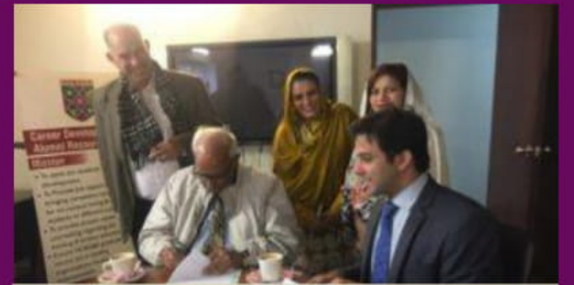
National Institute of Banking and Finance (State Bank)