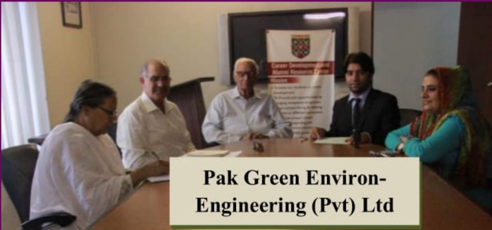
Pak Green Environ-Engineering (Pvt) Ltd